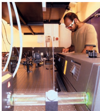
FIGURE 1 Quantum Technology Laboratory at UQ.

The quantum dot quantum computing group has a state-of-the-art capability to resolve and coherently probe single quantum structures over a wide range of wavelengths and temperatures. A Tsunami Titanium Sapphire laser (average power 2.6 W, pulse duration 60 fs) is used in combination with an optical parametric oscillator (Opal) with doubling unit, providing electromagnetic radiation from 350 nm to 3.5 \mu\text{m} . The laboratory is also equipped with a modular confocal/multiphoton optical microscope with a cryogenic, fully automated, high precision stage. Detection of the signal is achieved using a high-resolution spectrometer with a state-of-the-art Peltier-cooled electron multiplying CCD array (Andor Ixon) and/or a high resolution Fabry-Perot etalon coupled to a second cooled EMCCD. A time-correlated single photon counting fluorescence lifetime spectrometer (PicoQuant) is also available for further diagnosis of the fluorescence. Finally, precision automated translation stages and vibration isolation equipment are available for assembling a Michelson interferometer